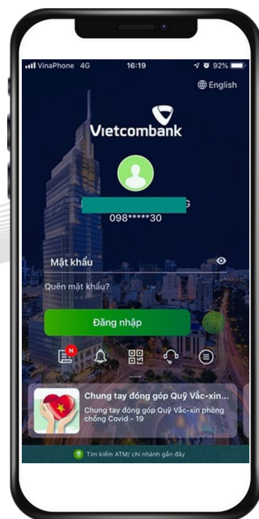
Step 1: Login VCB Digibank app